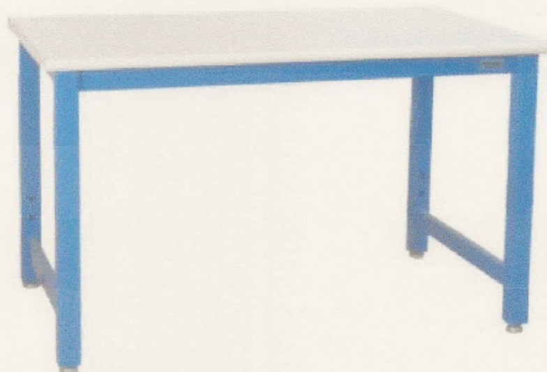
K-SERIES WORKBENCH, MODEL KF4872

This report serves to document the testing of the above sample tables to all applicable test paragraphs of ANSI/BIFMA X5.5-2008, tests for office desk and table products. All applicable tests required for complete certification were performed on the largest size sample listed above. Observations were made on all of the smaller sizes of this same series and considered to conform by similarity, as construction details were identical. The remainder of this report will show how the table submitted for testing met the requirements needed for conformance to the stated test paragraphs of the standard.